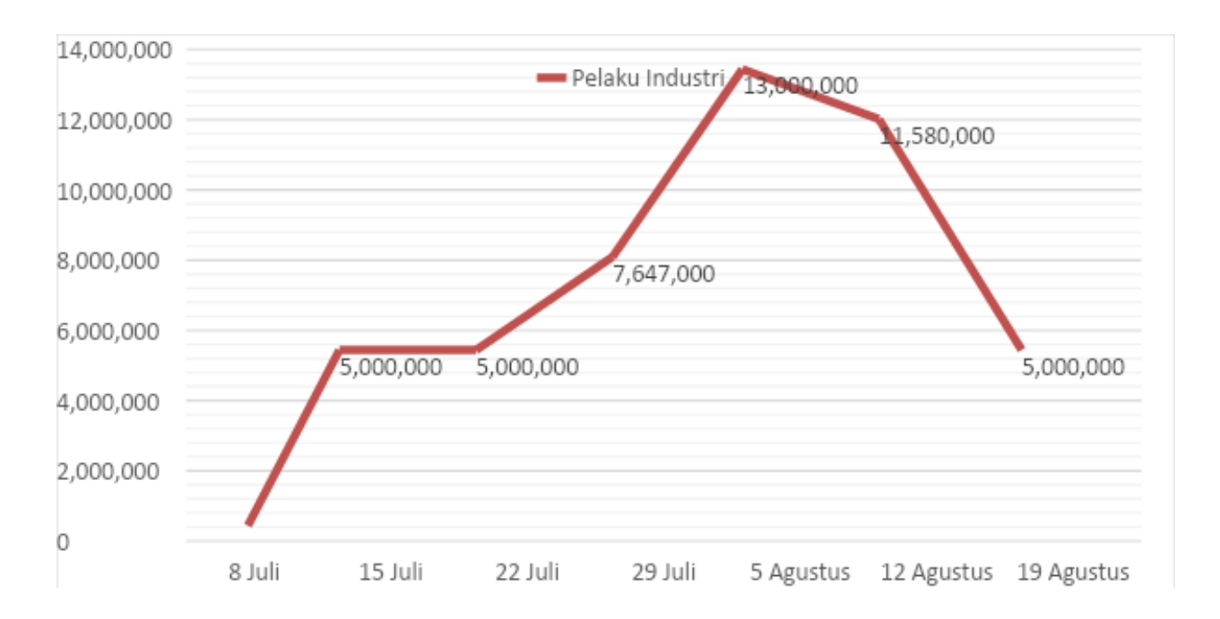
Figure 5. Number of Fines Averaged for Industries and Business Health Protocol Violations in Rupiah (Compiled by the Researchers, 2022)