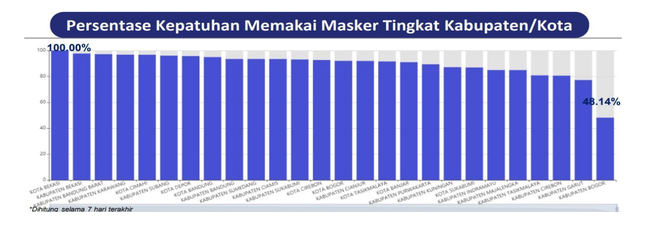
Figure 1. Mask Usage Compliance Rate at the City/Regency Level in West Java (Satgas COVID-19, 2021)