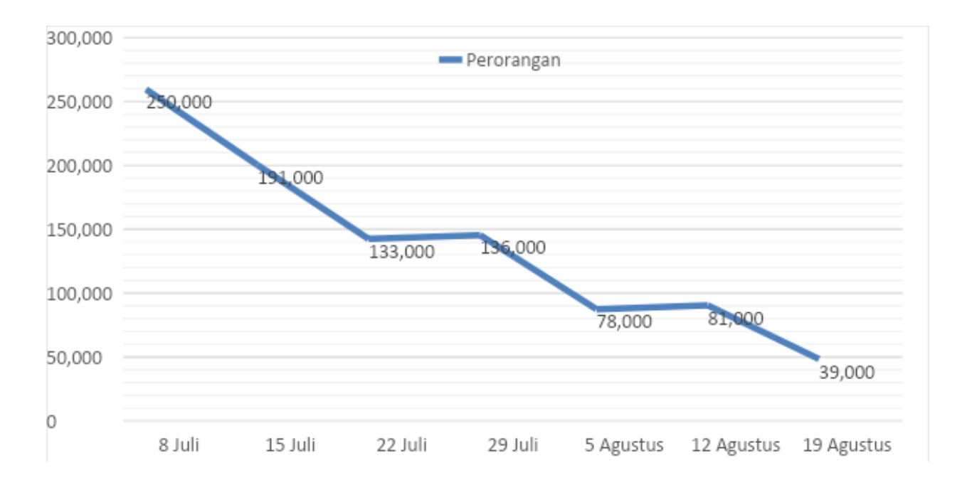
Figure 4. Number of Fines Averaged for Individual Health Protocol Violations in Rupiah (Compiled by the Researchers, 2022)