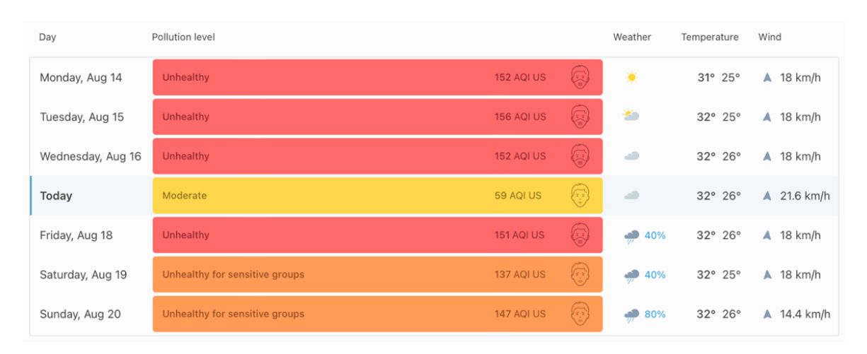
Figure 2. Air pollution in Jakarta between 14 and 20 August 2023

To overcome those problems stated in the previous paragraph, Autonomous vehicles (AVs), particularly those with level 4 and 5 automations, present a promising solution. These advanced vehicles are designed to minimize human errors, which are a significant cause of accidents. Beyond enhancing safety, AVs, especially electric ones, offer substantial environmental benefits. Studies indicate that electric AVs could reduce air pollution by 17-30% (Brown and Dodder 2019; Taiebat et al., 2019). Given Indonesia's high road accident rate, where 13 accidents occur per hour and result in three fatalities nationally between 2019 and 2021 (Statista 2022), the deployment of AVs could significantly improve both road safety and environmental quality.